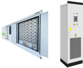
IMAGE OF ENERGY STORAGE CABINET IN INDUSTRIAL PARK

Chengdu Jianzhou New City Energy Storage Industrial Park. Not long ago, the news of the Chengdu Jianzhou New City Energy Storage Industrial Park in Sichuan swept the energy storage circle. The park is reported to ???