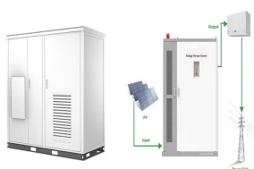
IMAGE OF ENERGY STORAGE CABINET IN INDUSTRIAL PARK

What is a lihub energy storage system? The LiHub has a standard one-cabinet-one-system design, each system is completely independently controlled. Multiple cabinets can be connected in parallel to expand the size of the energy storage system, enabling flexible configurations. All-in-one, high-performance energy storage system for various industrial and commercial applications.