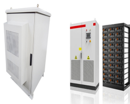
IMAGE OF ENERGY STORAGE CABINET IN INDUSTRIAL PARK

Company profile: Founded in 2020, Voltfang, based in Aachen, Germany, focuses on manufacturing stationary energy storage systems through lithium battery recycling for electric vehicles. Its latest product, Voltfang 2, has ???