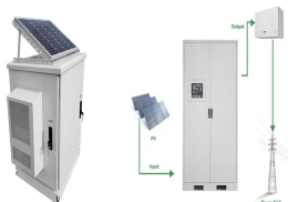
PHOTO VOLTAICS EGYPT

The Egyptian Government launched a solar Feed-in-Tariff programme in 2015 with a goal of generating 20% of energy from renewable sources by 2022. With a planned capacity of 1.8 GW and covering 36 km 2 , the Benban site near Aswan was in 2019 the world's largest one-site solar project. Scatec entered the market in 2015 and with 380 MW in