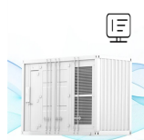
FLEXIBLE SETTING OF MULTIPLE WORKING MODES

Solutions. By Industry; Investor-Owned Utilities Discover the leading distributed energy platform that is trusted by investor-owned utilities to leverage distributed energy resources.; Municipal Utilities Boost public trust and support ???